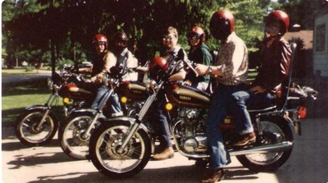
Easy Riders '82