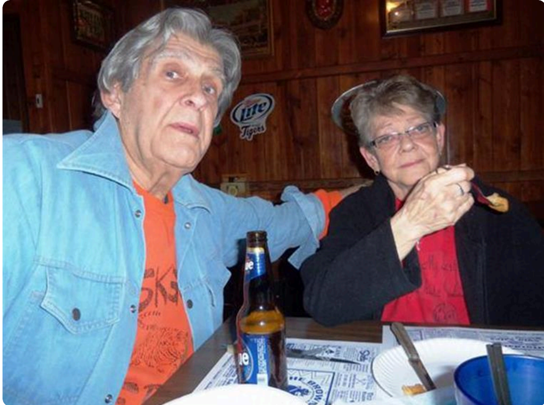
With my beloved little sis-in-law 3/12/2013